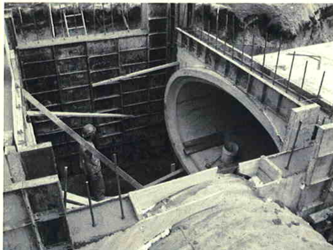
A worker stands in a 16-foot by 14-foot storm sewer structure. This is the largest storm water structure constructed in the Tri-Cities area.

The storm water portion of the project included a number of measures that will limit or mitigate pollution from entering area waterways. These include hydrocarbon absorption booms to trap petroleum based pollutants and over 900 feet of vegetative shelving downstream that will trap sediment and allow for pollutants to be removed by the vegetation.